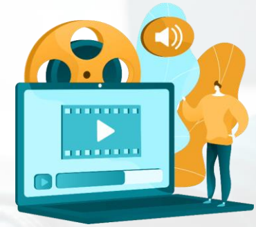
Video designing and editing